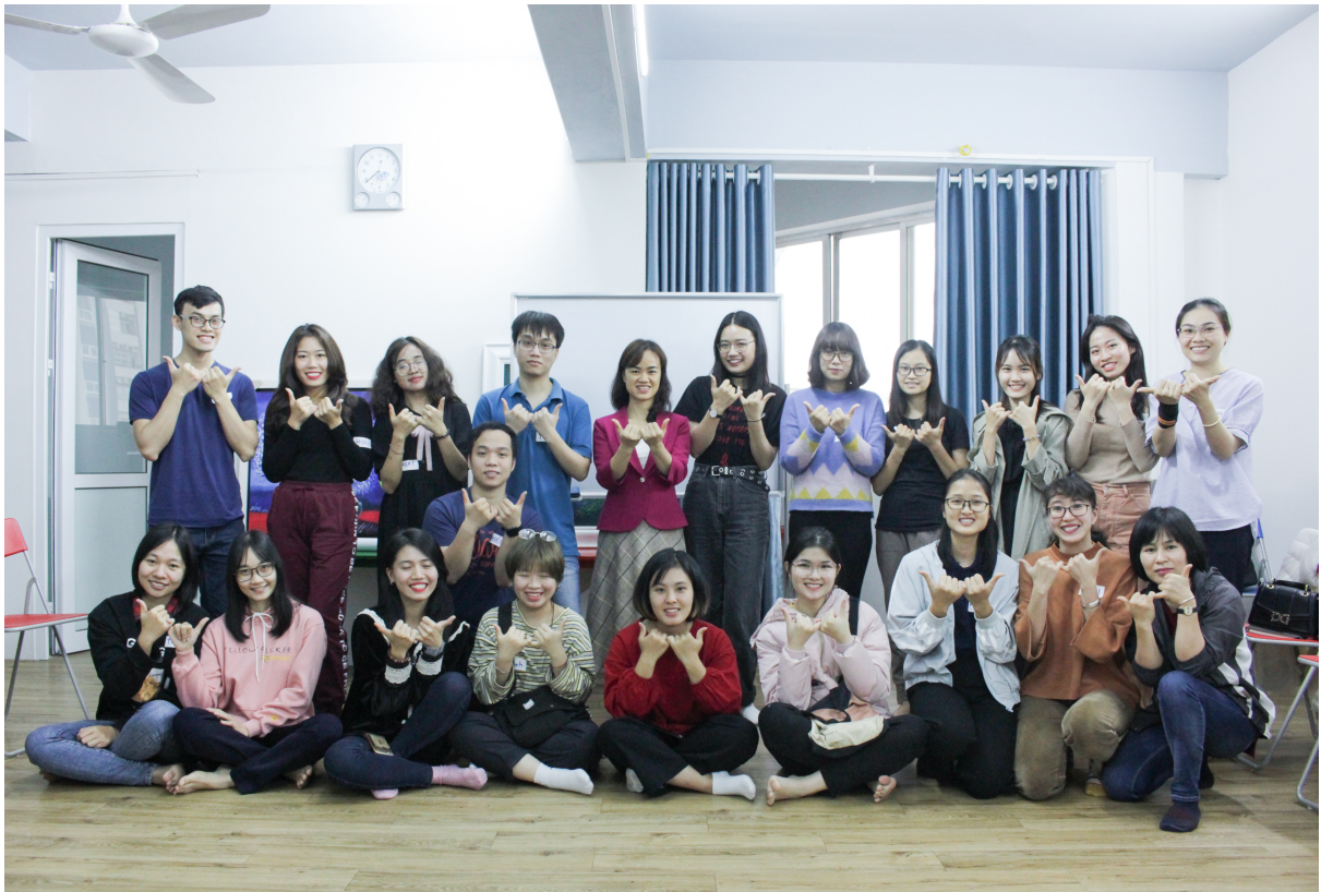
The spirit of Ngay Mai

The name Ngay Mai comes from the idea that before hanging up, volunteers would invite the caller to phone in again "tomorrow" to make sure that they are alright. Knowing that there is someone who cares enough to wait and check in can help those who are struggling feel less alone, as well as gain strength to not give up during dark times. Indeed, tomorrow will always be a chance to start anew and move forward.