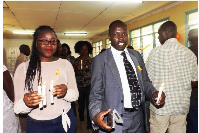
Participants during the candle lighting ceremony.

B efrienders Kenya marked the World Suicide Prevention Day for the 5 th time in the country on 10 th September 2016. The theme for this year was Connect, Communicate and Care and the venue was at a school in Nairobi city centre.