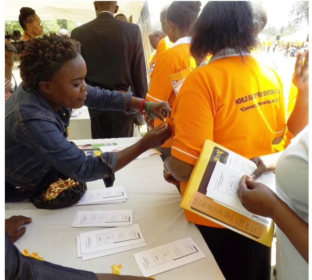
From left Befrienders Kenya Volunteer assist a participant pin on the ribbon.

The event was filled with pomp and colour from the beginning with a procession which raised awareness on the event and the day as participants clad in the orange T-shirts led by the prisons band marched to the venue. There was also entertainment by various groups including medical students at the hospital, primary school children from the locality and some of the patients at the institution entertained the guests with skits, dances and songs.