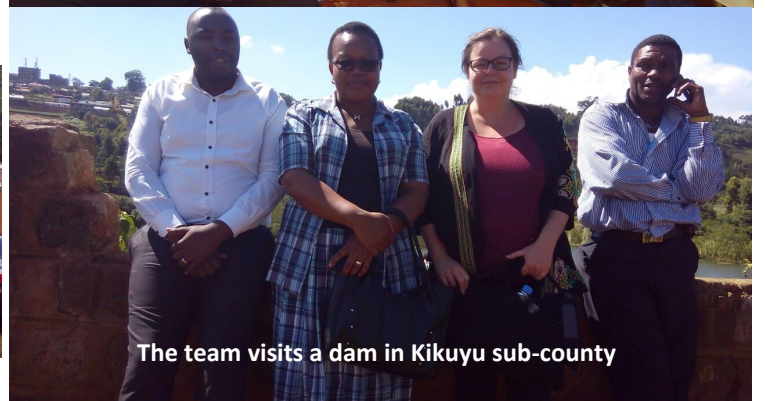
The team visits a dam in Kikuyu sub-county