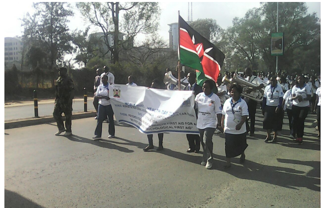
A procession led by Ministry of Health officials.

It was noted that just as the general health care which does not consist of physical first aid alone, similarly no Mental Health care system should consist of psychological First Aid alone. Investment in psychological First Aid is part of a longer-term effort to ensure that anyone in acute distress due to a crisis can receive basic support and that those who need more than psychological First Aid will receive additional advanced support from health, Mental Health and social services.