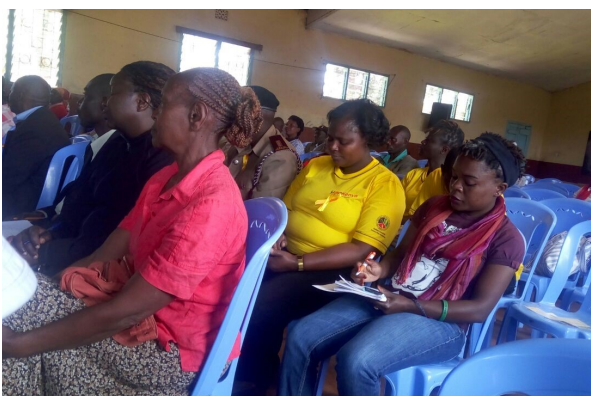
Befrienders Kenya volunteer in Karatina.

The message for the day was Psychological support is vital in dealing with Mental Health with emphasis that, there is a need to ensure that when crisis events occur part of the humanitarian response is appropriate and timely mental health support including psychological first aid hence the need to be conscious of the need to provide the right support when people experience the stress of traumatic events, both in the Kenyan context and on an individual level.