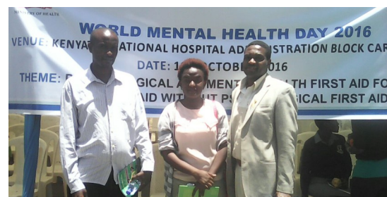
Befrienders Kenya volunteers at KNH.