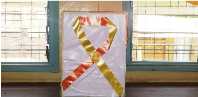
The newly launched Suicide Prevention Awareness Ribbon.