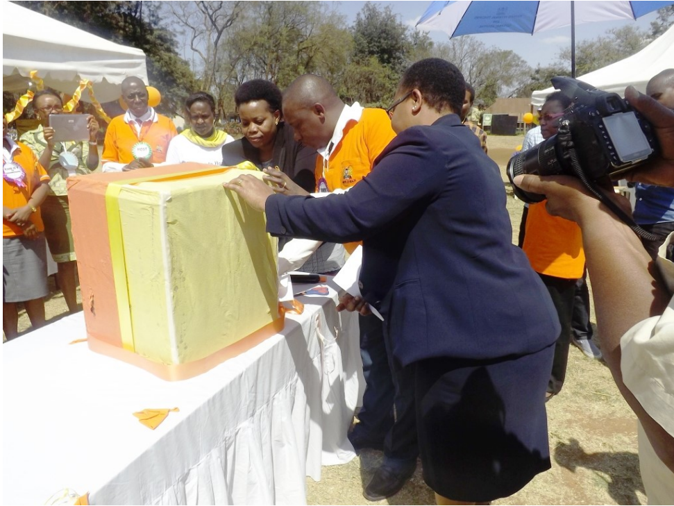
Befrienders Kenya Directors assist in the launch of the Suicide Prevention Awareness Ribbon.

A ccording to the World Health Organization 7,126 Kenyans commit suicide every year while Kenya is ranked 29 th in the world with regard to its suicide rate, though the number may be higher since suicide is a crime in Kenya and often concealed hence there are no clear records.