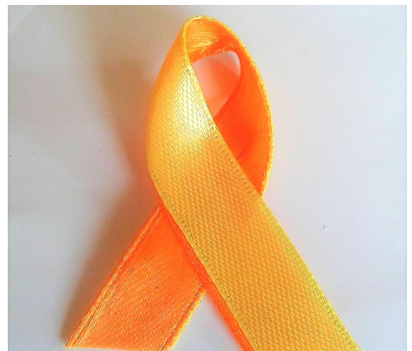
Newly launched Suicide Prevention Awareness ribbon.

‘What Mental Health needs is more sunlight , more Candor, more unashamed conversation about illnesses that affect not only individuals, but their families as well.’