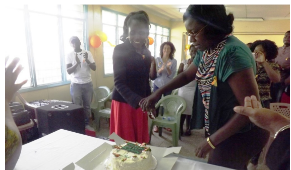
Befrienders Kenya share a cake with participants.