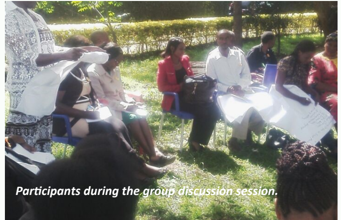
Participants during the group discussion session.