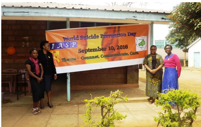
Befrienders Kenya volunteers during the WSPD.

B efrienders Kenya marked the World Suicide Prevention Day for the 5 th time in the country on 10 th September 2016. The theme for this year was Connect, Communicate and Care and the venue was at a school in Nairobi city centre.